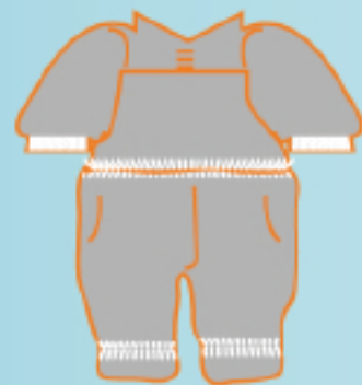
Habit de neige